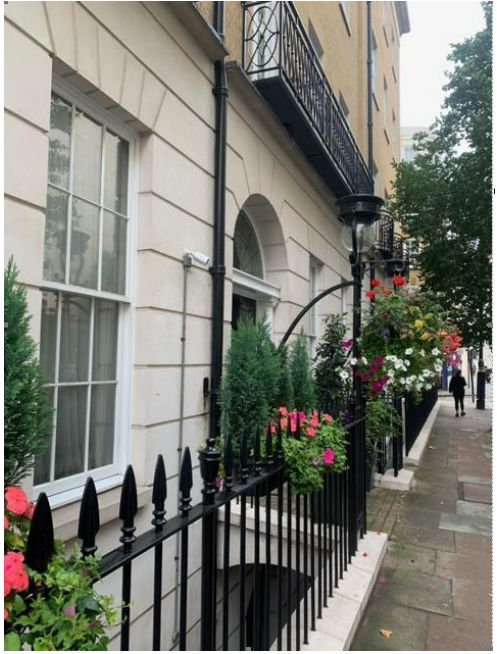
One the way to the Wallace collection