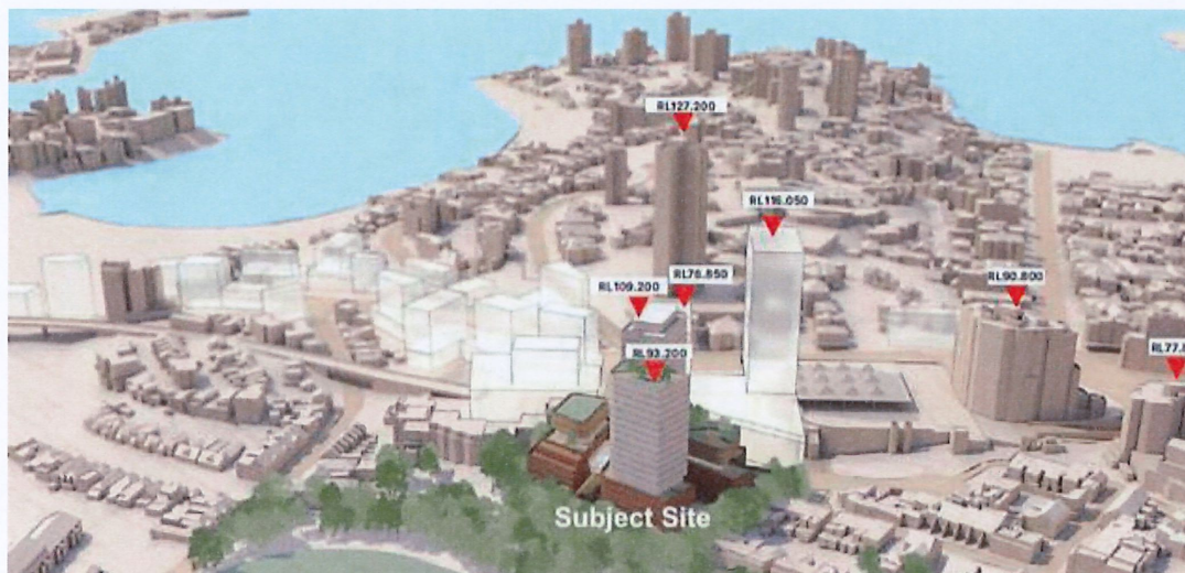
Figure 1: Proposed concept design height building in context with Edgecliff local centre existing and anticipated built form

to Trumper Oval and will result in a significant urban design flaw where a 23 storey tower will dominate the established open space provision to the south. Refer to Figure 1 below which effectively demonstrates this.